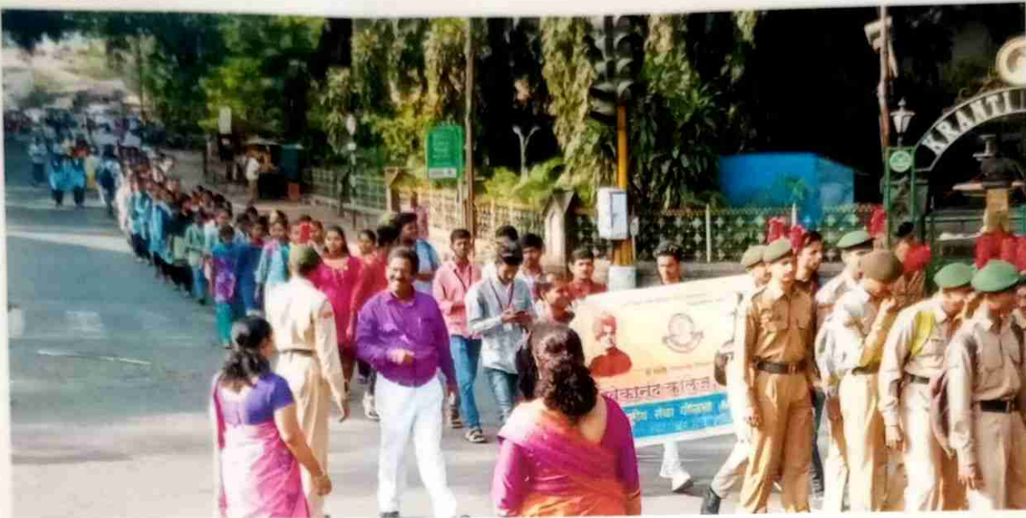
Photo: AIDS Awareness Rally from CPR, Kolhapur to Bindu Chock, Kolhapur.