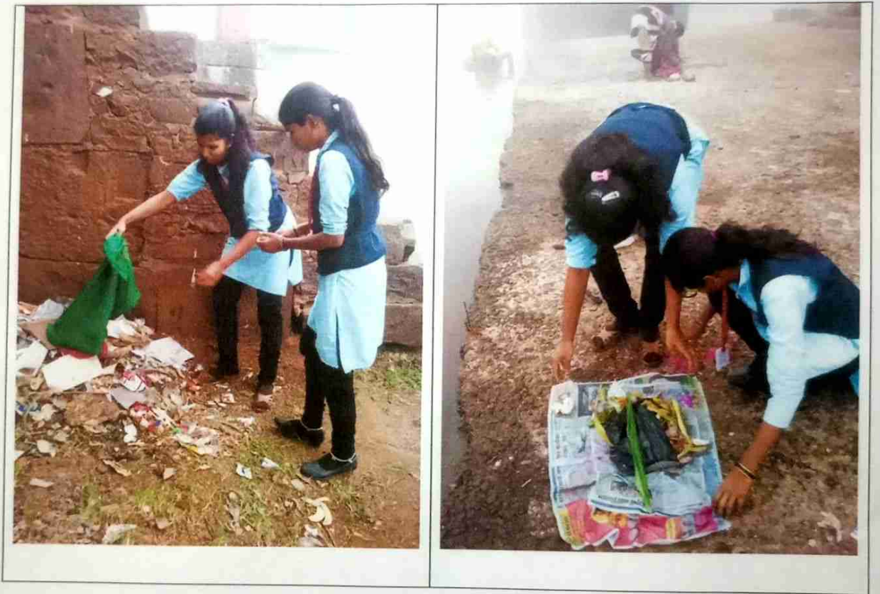
Photo: Cleanliness activity at Panchganga River Ghat, Kolhapur

10. Signatures of coordinator/ organizer: