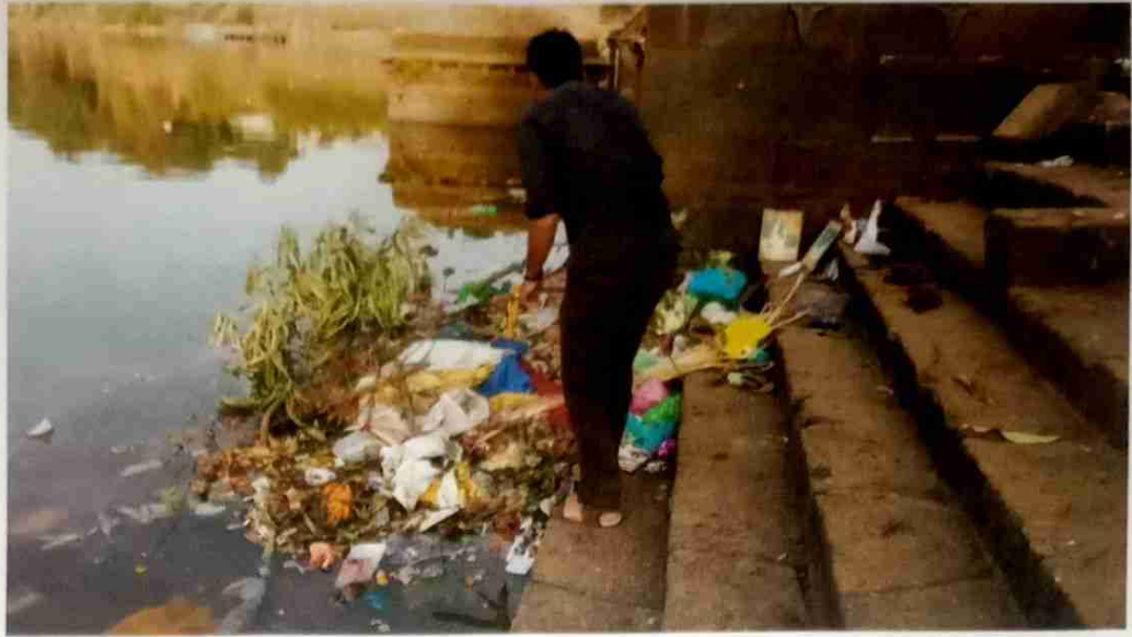
Photo: Cleanliness activity at Panchganga River Ghat, Kolhapur