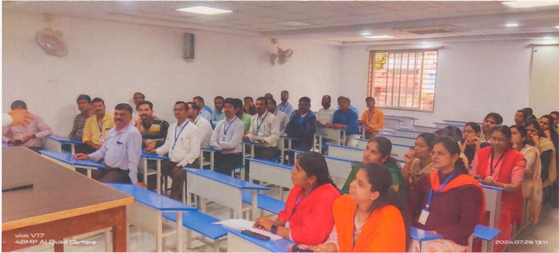
Participants for the Program

X. Signatures of coordinator/ organizer: