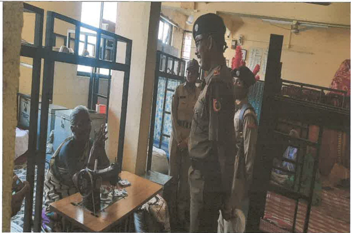
DISTRIBUTION OF DAILY NEED ITEMS IN EKI ORPHAN HOUSES 01/01/2022