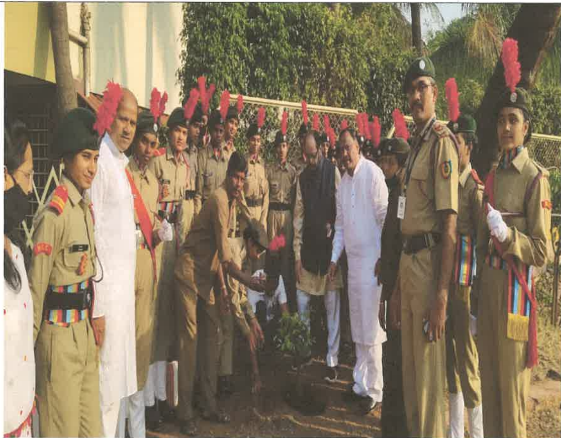
Tree Plantation And Cleanliness