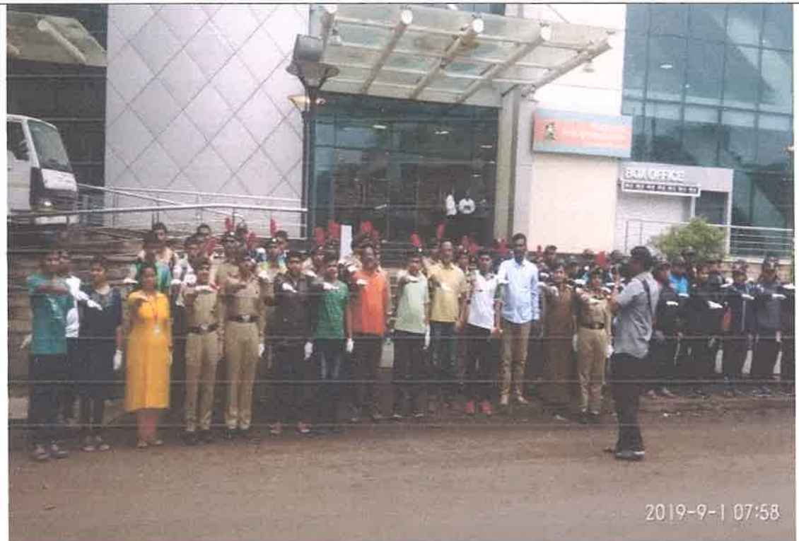
CLEANLINESS DRIVE AFTER FLOOD IN LAXMIPURI ,KOLHAPUR 01/09/2019