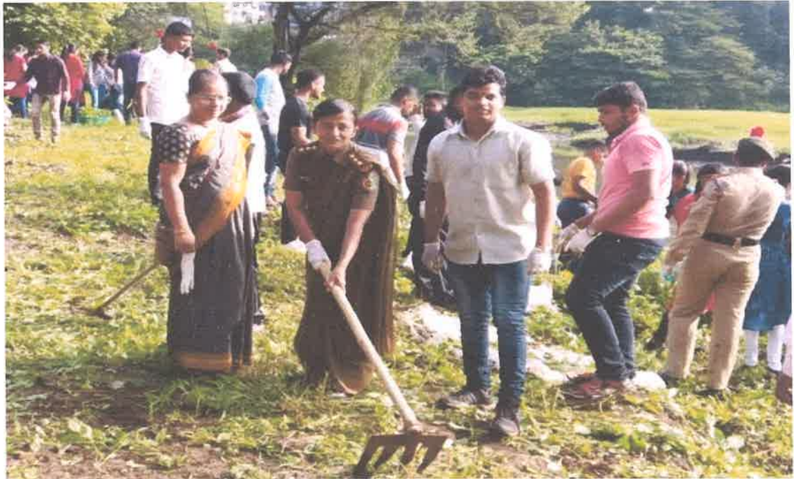
Plastic eradication 20/07/2019