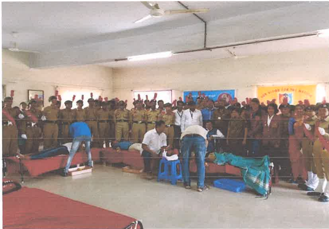
Blood Donation Camp 17/01/2020