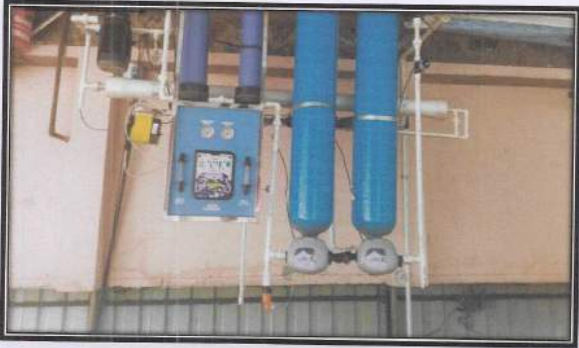
Water Filter will cooler in Mess