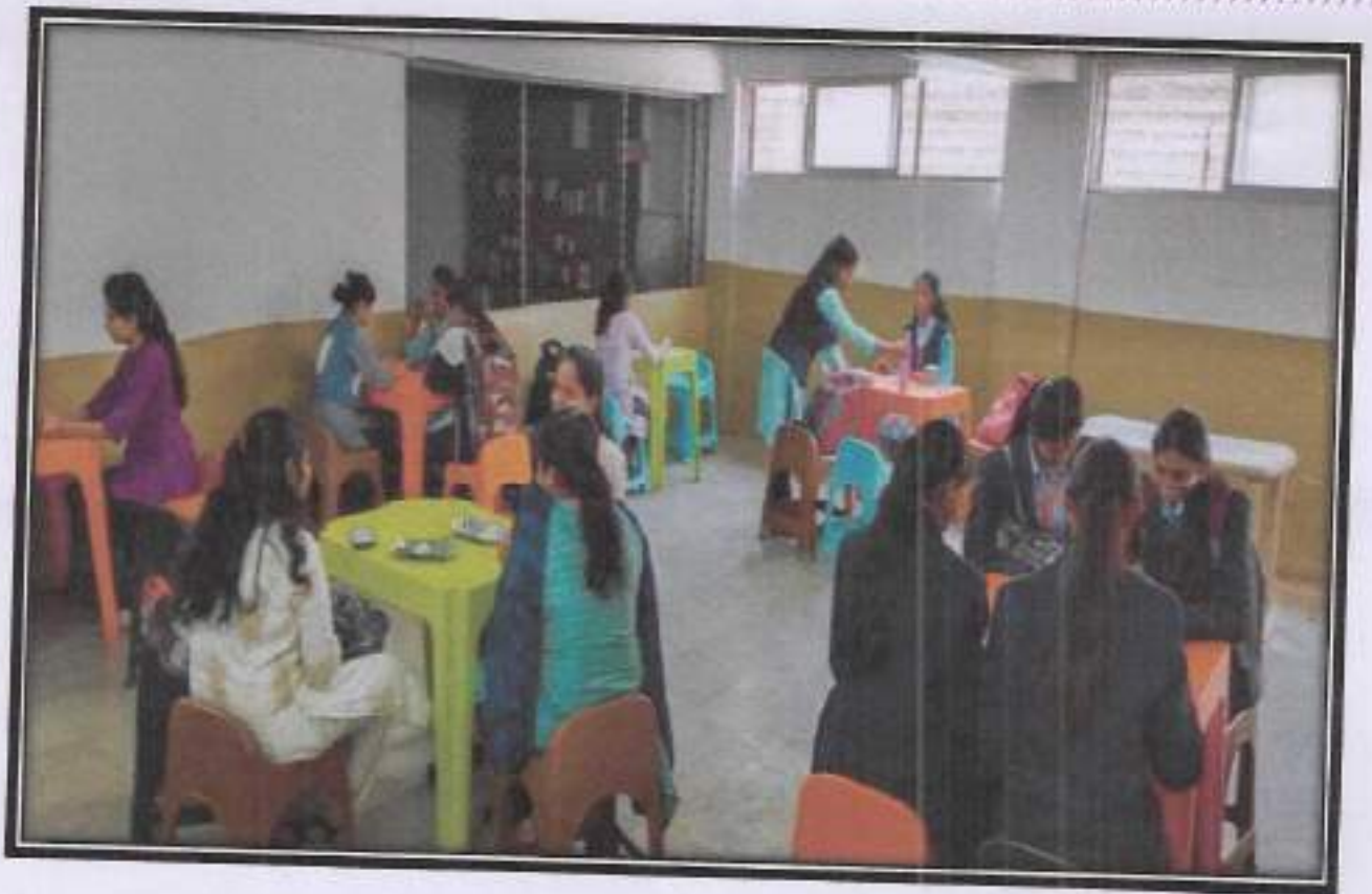
11. Health centre for girls: Every Saturday the health centre remains open for girls' students, the Gynaecologist regularly do orientation regarding health issues of girls.