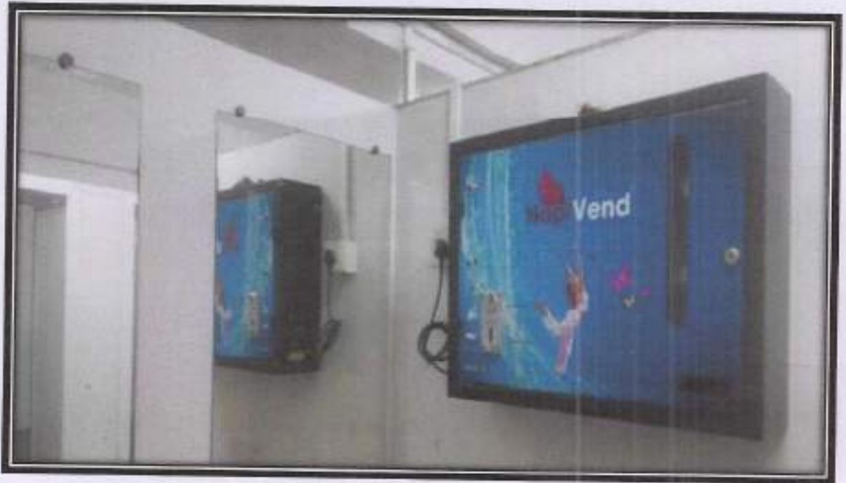
Sanitary Pad Burner in the Girls' Washroom

There are four Sanitary Pad Wending machines and Burners situated in the four Girls' Washrooms in the college. It saves girls from the inconvenience caused during menstrual periods in case if there is lack of sanitary pads. Besides, the burners promote proper disposal of the used pads