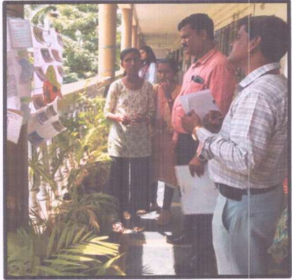
Poster Presentation Competition