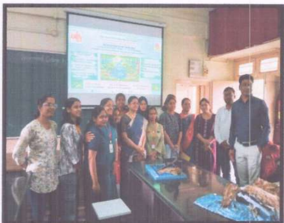
Craft Model Competition