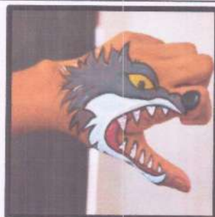
Face and Hand Painting Competition