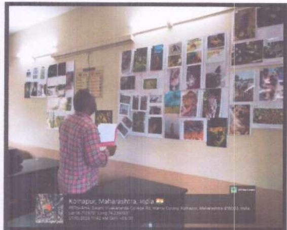
Animal Photography Competition