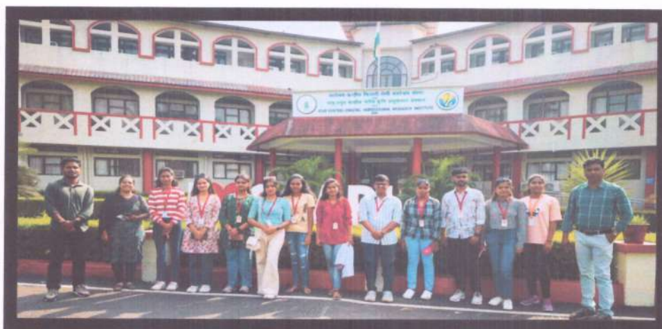
Visit to ICAR Central Coastal Agricultural Research Institute Goa