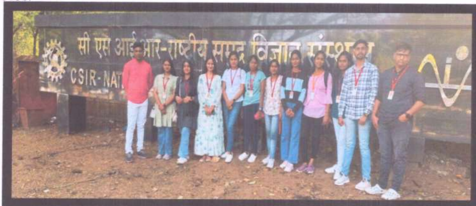
Visit to National Institute of Oceanography (NIO, Goa)