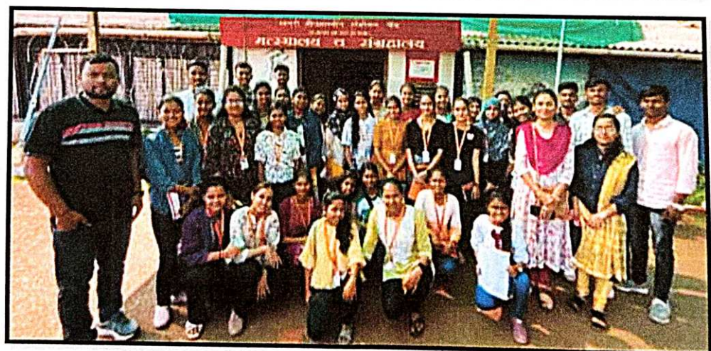
B. Sc. I Study tour -Ratnagiri