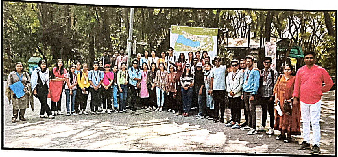
Visit to "Rajiv Gandhi Zoological Snake Park, Katraj, Pune"