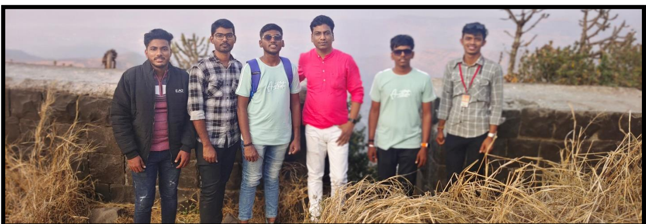
Photos: B.Sc. II Study Tour at 'Rajiv Gandhi Zoological Park and Sinhagad Fort, Pune'