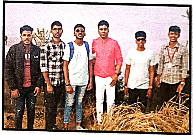
Visit to Sinhagad Fort