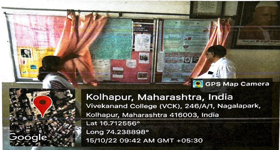
The Principal inaugurating Wallpaper Presentation.