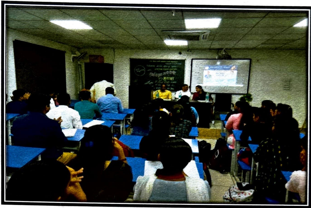
A glimpse of interaction by guests with students

10. Signatures of coordinator/ organizer: