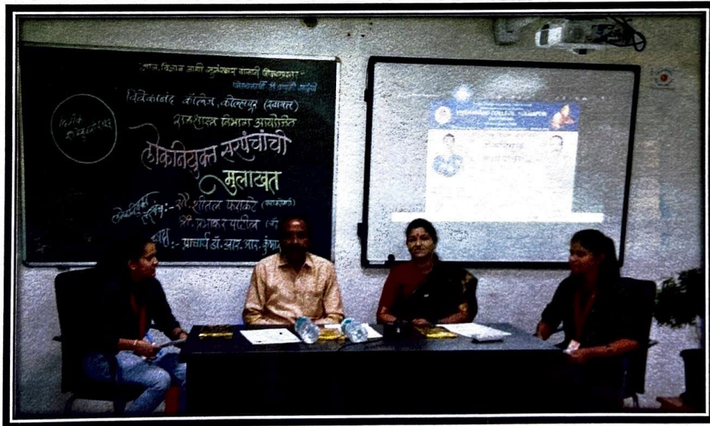
A glimpse of the interview with Sarpanchs