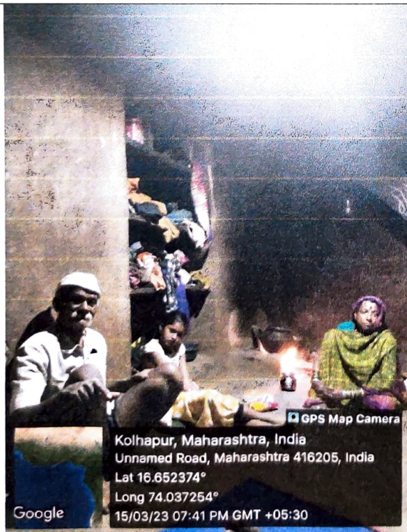
A glimps of village household