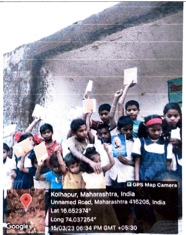
Students with distributed study material