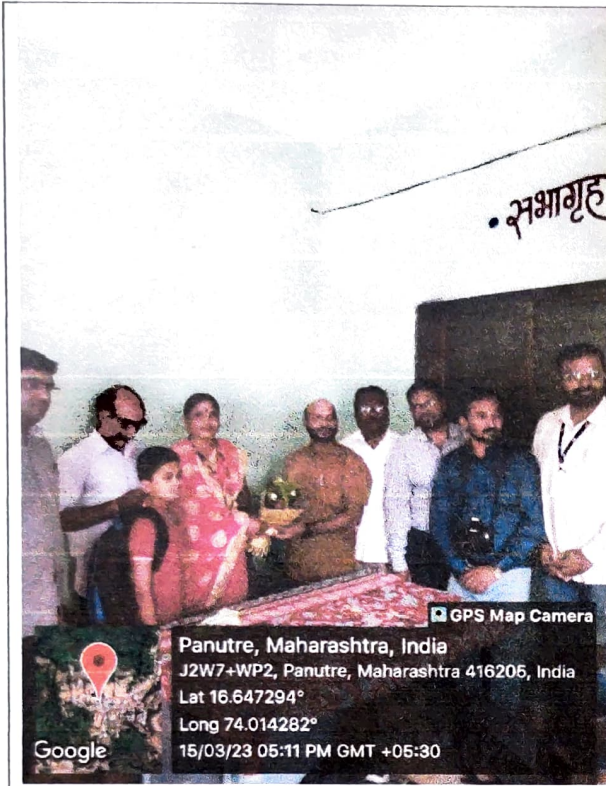
Meeting with Sarpanch