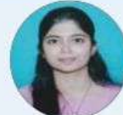
Nishi Shruti Prerati Shikshan Mahamandir Dr.Bapuji Salunkhe College, Manj