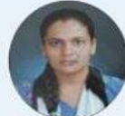
Bharati Arpita Vilas Vivekanand College Kolhapur