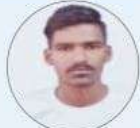
Dighe Pradip Uttam Sangola College Sangola