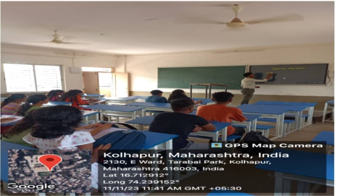
B.Sc. I lecture by using Smart TV panel, 11 th Nov., 2023