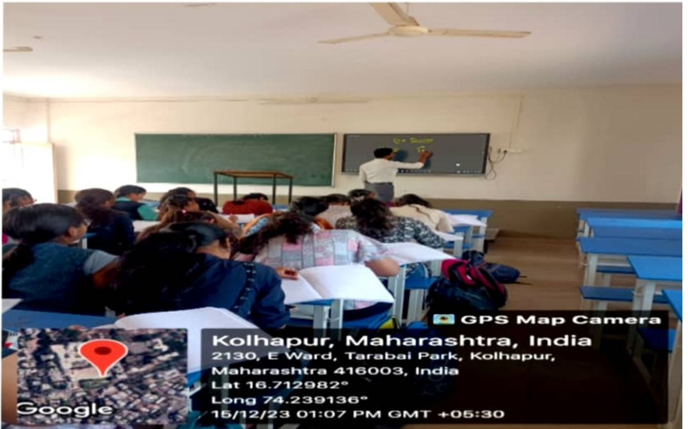
B.Sc. III lecture by using Smart TV panel, 16 th Dec., 2023