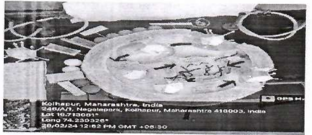
Models presented by students