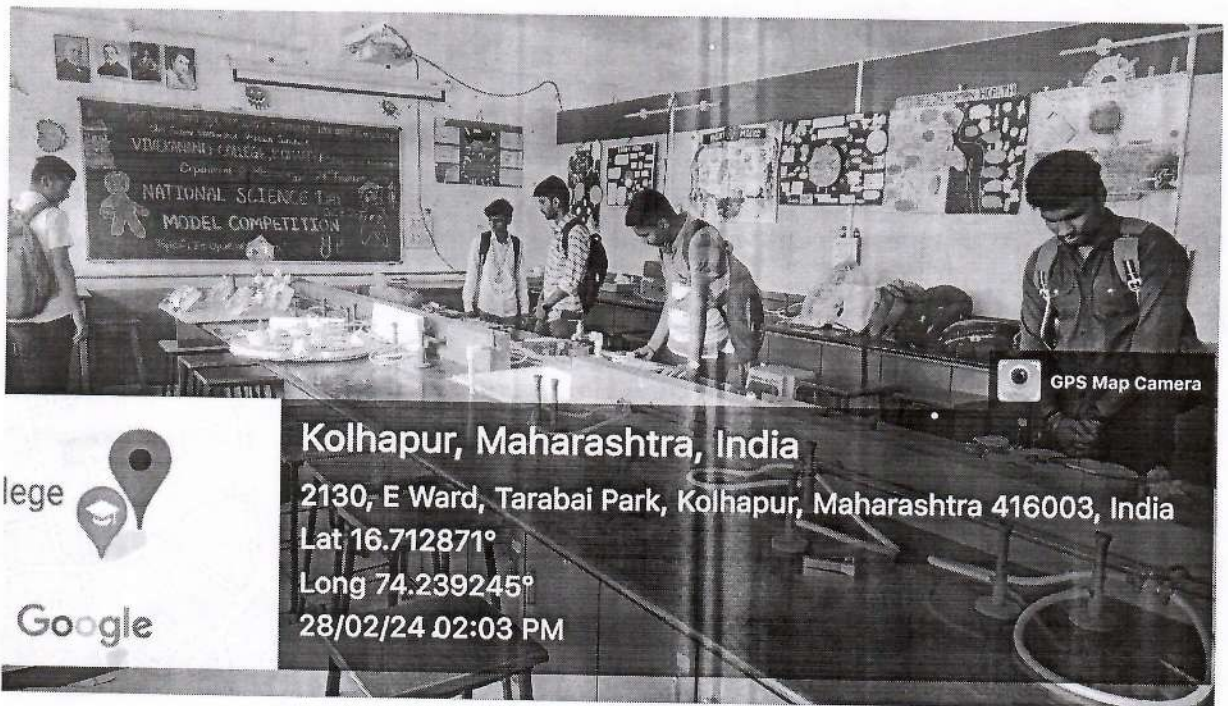
Model competition on the topic "Life cycle of viruses"