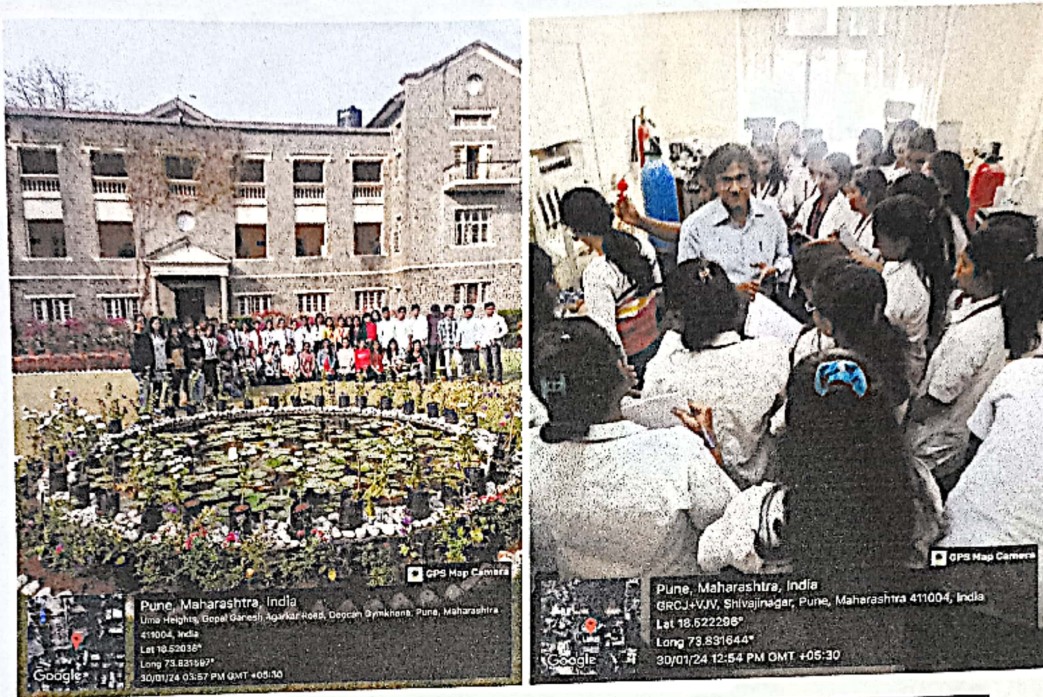
B.Sc. III study tour at Agharkar research institute, Pune on 30 th Jan., 2024