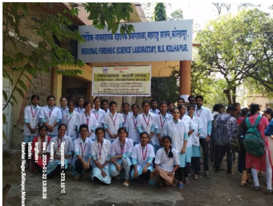
B.Sc. III Students visit to Forensic Lab., Kolhapur 2020