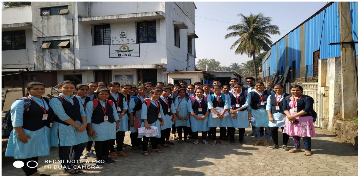
B.Sc.II study tour at S.G.Phytopharma, gokulshirgoan ,MIDC,Kolhapur