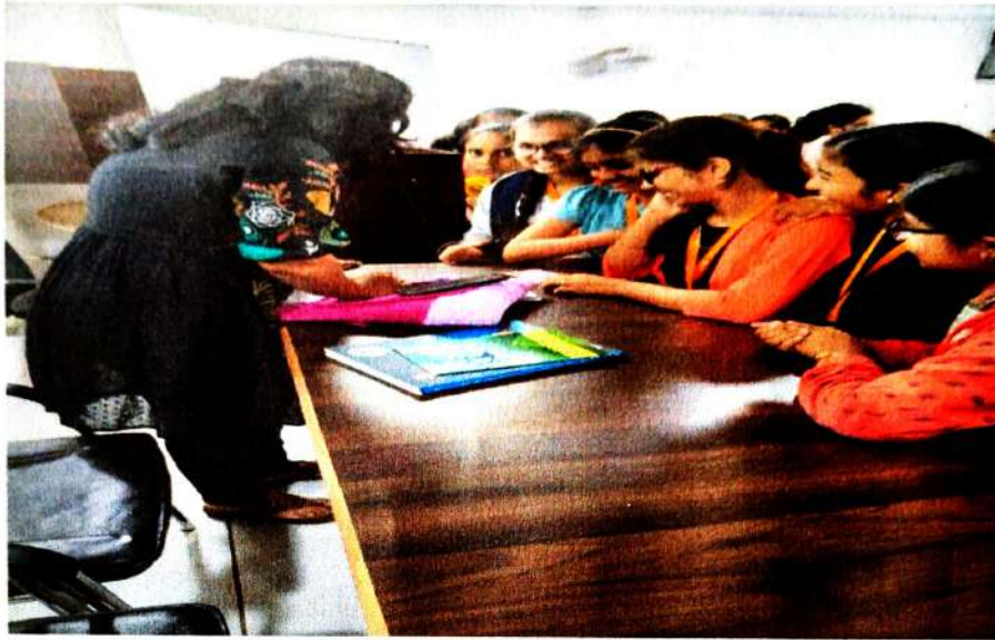
Students attending the Guest Lecture