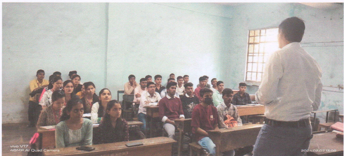
Question Answer session with students