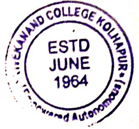
Student Progression 2024-25