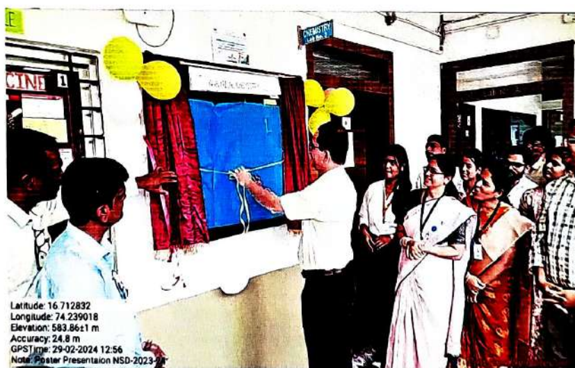
Inauguration By Shri S.P. Thorat.