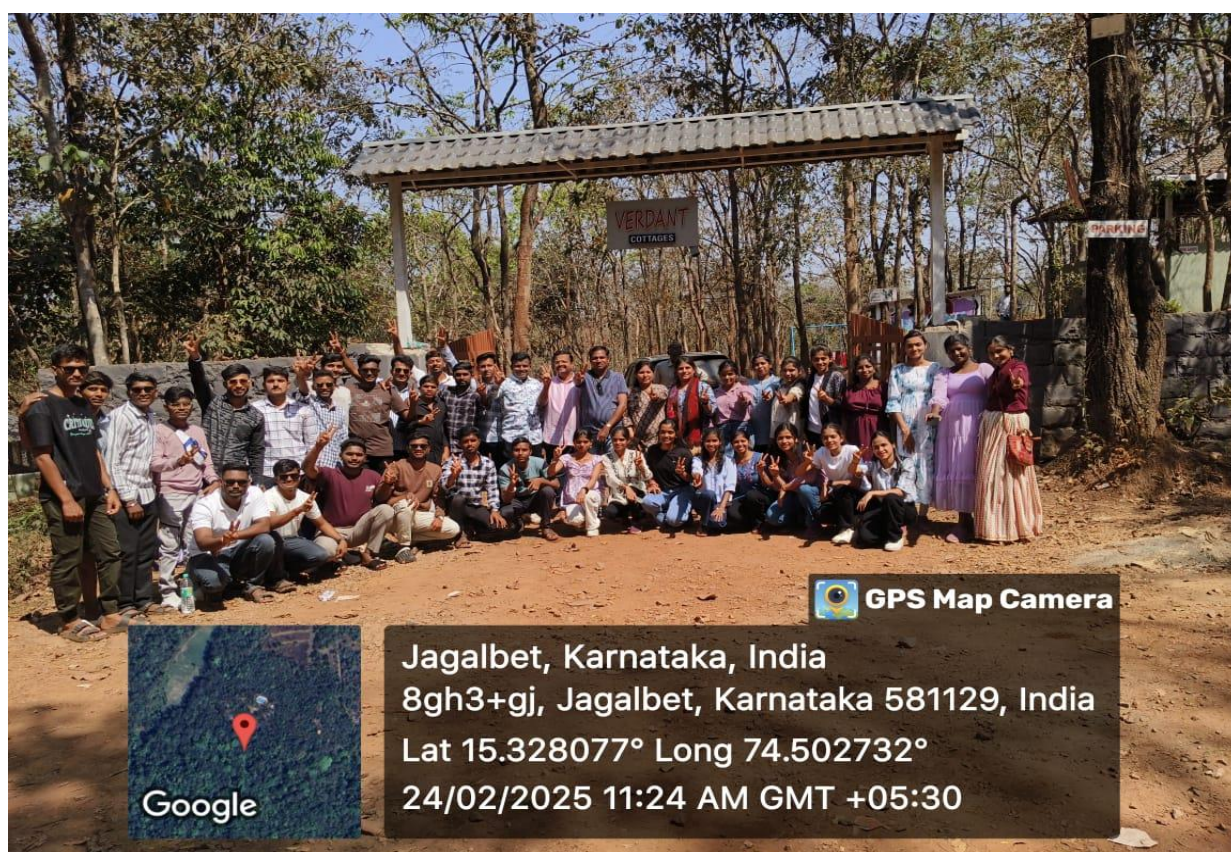
Department of chemistry, Vivekanand College, Kolhapur M.Sc. II year students visited to Dandeli