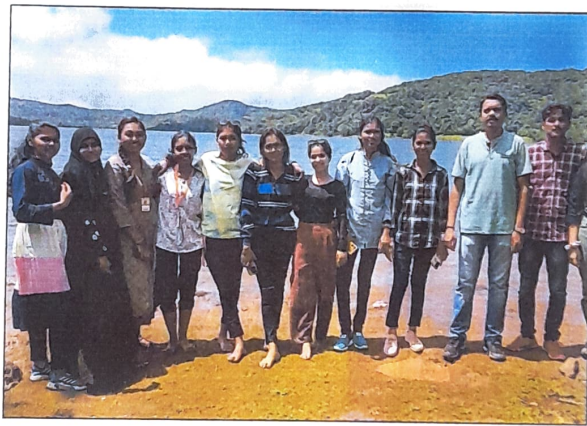
B.Sc. II ( Major) and B.Sc.III Students with the faculty