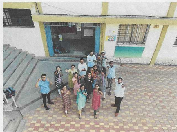
2020-22 Present Alumni