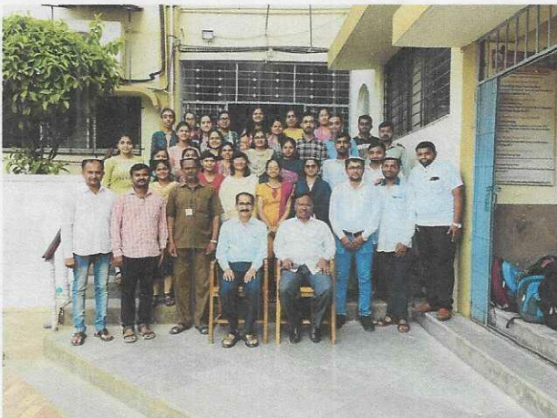
Alumni with Principal